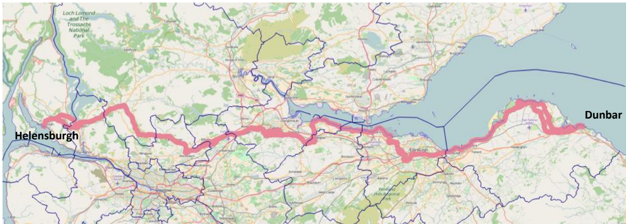
Figure 1. Route of the John Muir Way from Helensburgh in the west to Dunbar on the east coast.

The route of the John Muir Way stretches 134 miles (215 kilometres (km)) from Helensburgh in the west to Dunbar on the east coast (Figure 1). This walking and cycling route was opened in 2014 to commemorate the 100 th anniversary of John Muir's death.