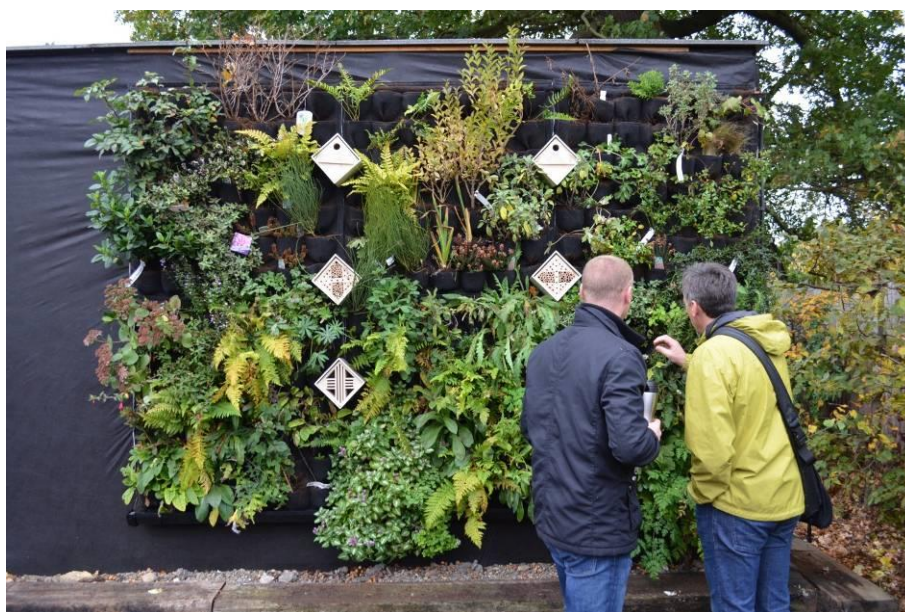
Figure 2. Example of a green wall that holds a variety of plants, including wildflowers. This particular green wall also has a variety of homes for insects and other bugs.

Surrounding several of the hospitals are large areas of amenity grassland that have very little benefits for biodiversity and people using and visiting the hospitals. Some hospitals do have designated areas for wildlife but many are limited with funding or with staff. By enhancing hospital grounds for nature through the creation of grassland meadows this will not only add colour and life to the area benefiting both people and wildlife but will also allow for the moving and mixing of species and individuals across the hospital grounds and surrounding landscape. Additionally, small wildlife gardens can be created closer to the hospital within areas that are well used by patients through the use of planters, green walls and/or insect homes (Figure 2).