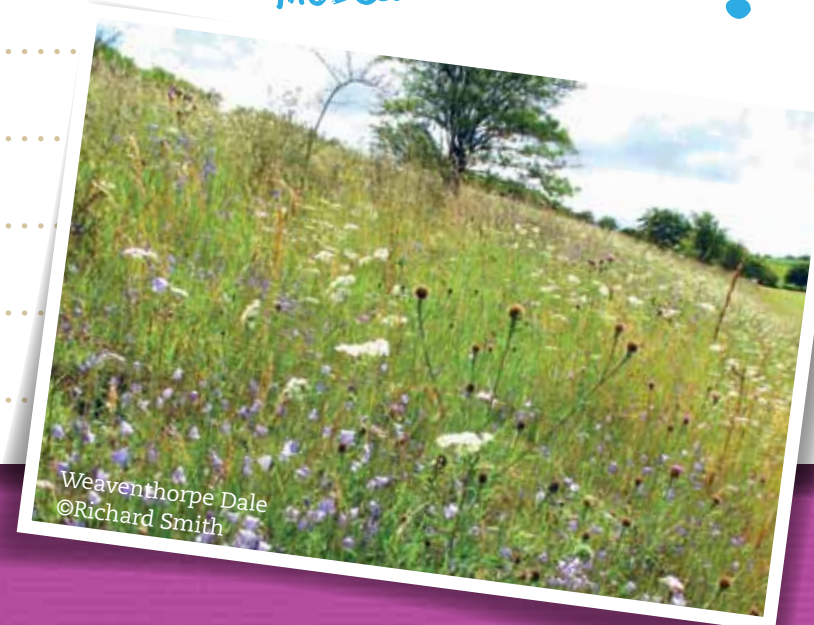
Weaventhorpe Dale

Always enquire about where the seed has come from!