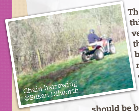
Chain harrowing

Wildflower meadows can be created by enhancing existing grassy areas by sowing wildflower seed or planting plug plants. However, just sowing wildflower seed onto a grassy area will not be successful. Wildflowers will struggle to grow in dense, vigorous grass – ground preparation is the key to success. You need to expose the soil or create gaps in the grass for wildflowers to stand a chance of growing.