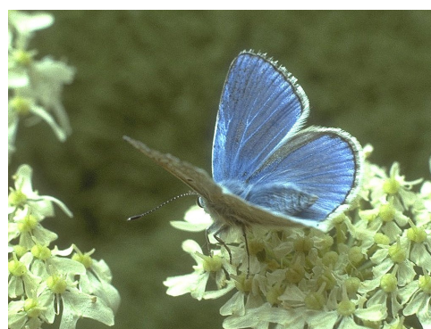
Common blue butterfly

As outlined above a list of twelve 'guiding principles' are being developed to underpin the development of the B-Lines. These 'guiding principles' outline the types of habitat we consider should form the core part of the B-Lines, provide guidance on the amount of habitat needed and suggest how this might be best located. They also highlight the importance of maintaining and enhancing existing wildflower-rich habitats, while promoting the need to restore/recreate some of that which has been lost.