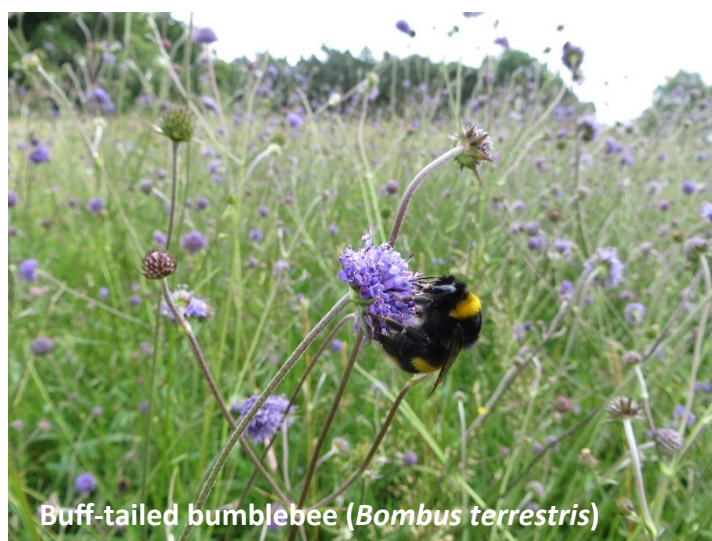
Buff-tailed bumblebee ( Bombus terrestris )

Welcome to the 'partnership issue' of the B-Lines update. As B-Lines spread across the country their development is increasingly driven by partnerships, whether with individual farmers, local authorities, wildlife charities, schools, churches, businesses or other organisations and you can read a little more about some of these in the coming pages. B-Lines continues to look for opportunities to deliver more pollinator-friendly habitats and we are always on the look out for others to contribute in 'their' part of the network. If you have any queries about getting involved or staying up to date with our work contact: Info@buglife.org.uk