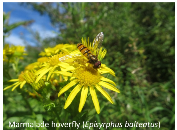
Marmalade hoverfly ( Episyrphus balteatus )

We hope the land purchased will provide vital habitat stepping-stones in the B-Lines network, helping pollinators move more easily around both our countryside and urban areas. So by using a mobile network, people can help support another network for bees – The B-Lines.