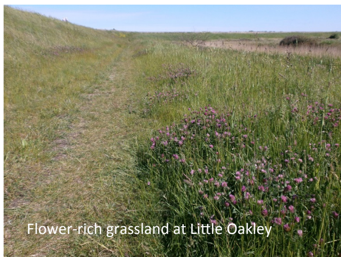
Flower-rich grassland at Little Oakley

bumblebee ( B. ruderatus ) and Red-shanked carder bee ( B. ruderarius ).