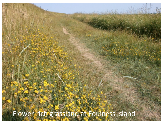
Flower-rich grassland at Foulness Island

www.essexfieldclub.org.uk/portal/p/Sea+Wall+Biodiversity+Handbook