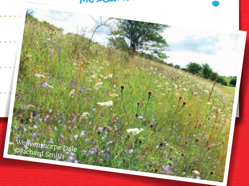
Weaventhorpe Dale

Always enquire about where the seed has come from. !