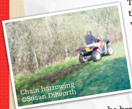
Chain harrowing

Existing grassy areas can be converted into meadows by sowing wildflower seed or planting plug plants. However, just sowing wildflower seed onto a grassy area will not be successful. Wildflowers will struggle to grow in dense, vigorous grass – ground preparation is the key to success. You need to expose the soil or create gaps in the grass for wildflowers to stand a chance of growing.